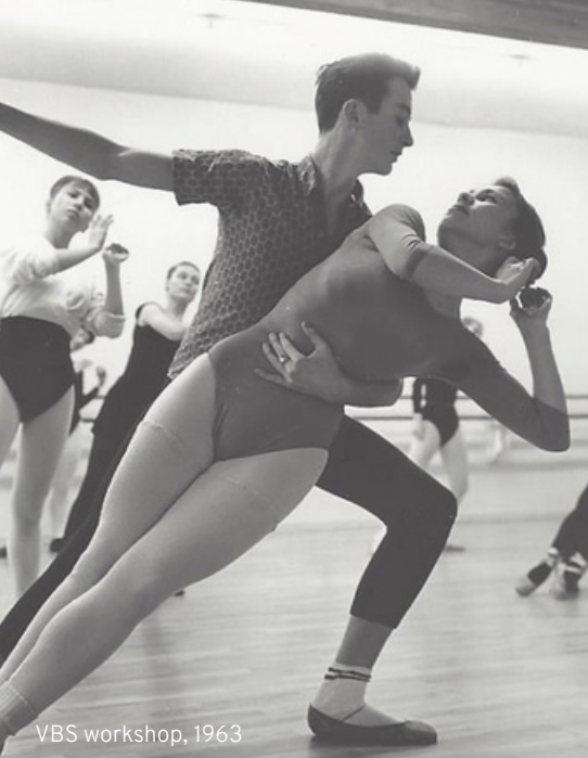
VBS workshop, 1963