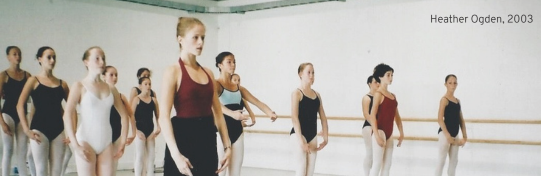
Heather Ogden, 2003