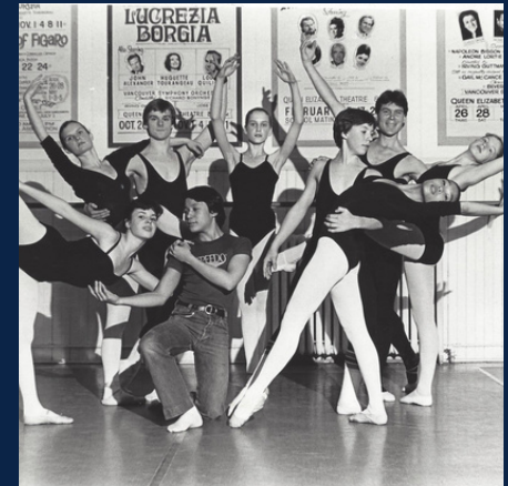
VBS scholarship winners, 1981