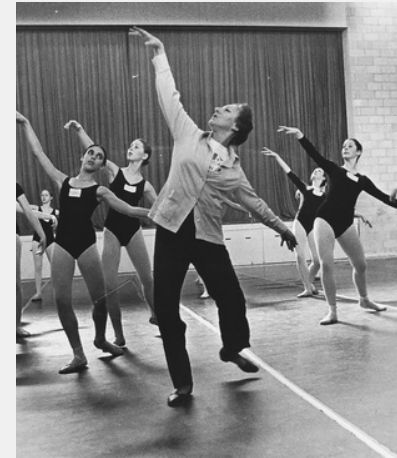
Celia Franca, 1977