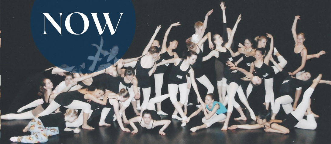
Spring Seminar, 2009